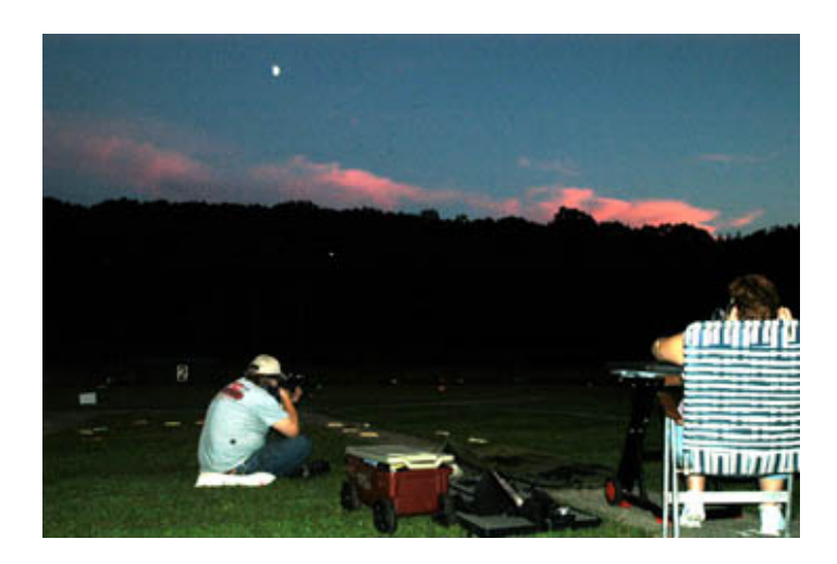
'Dusk is a great time to shoot – cool, little wind, lots of dump animals.

The nice part about doing the shoot in this manner is that less skilled shooters still have a good chance of earning some points by concentrating on the easy and moderately hard targets. Also, the less skilled shooter can beat a more skilled shooter if the skilled shooter overestimates his/her ability and ends up missing a number of difficult s