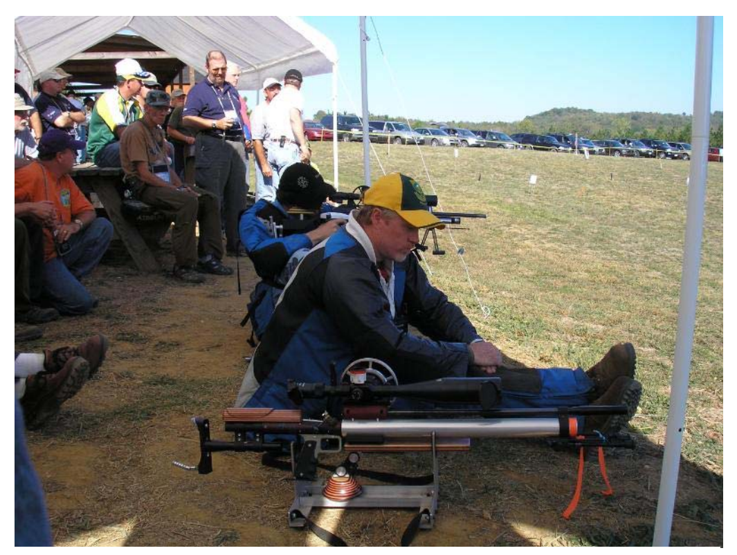
The shoot-off heard round the world!