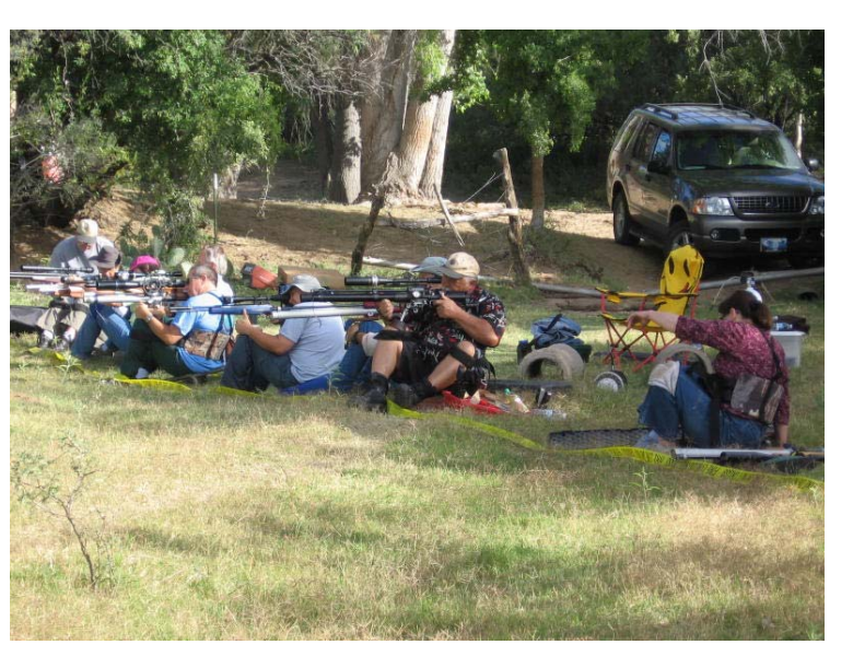
Sight in lane