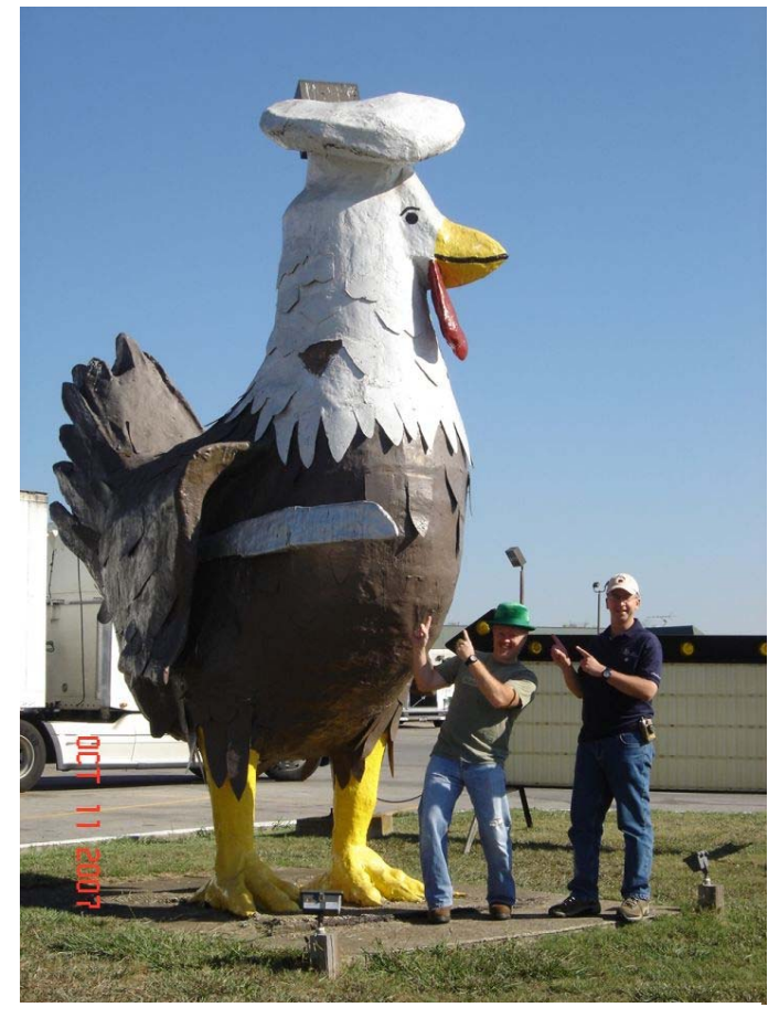
This is what's on the world champ's mind daily! He loves...the chicken?