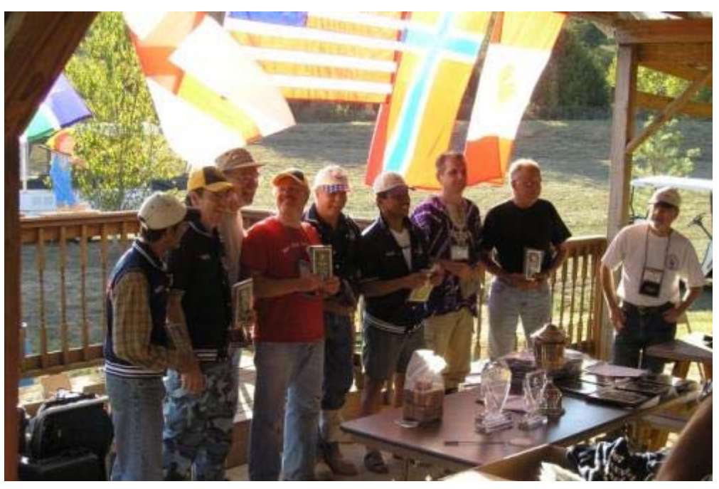
Team USA 1st Place World Champion Team