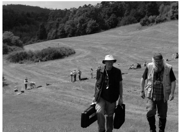
The trek up from the sight-in range.