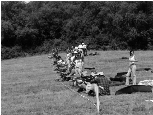
The sight-in range.