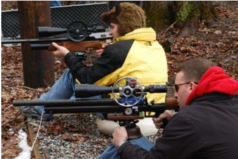
A couple of Day's taking aim at their balls