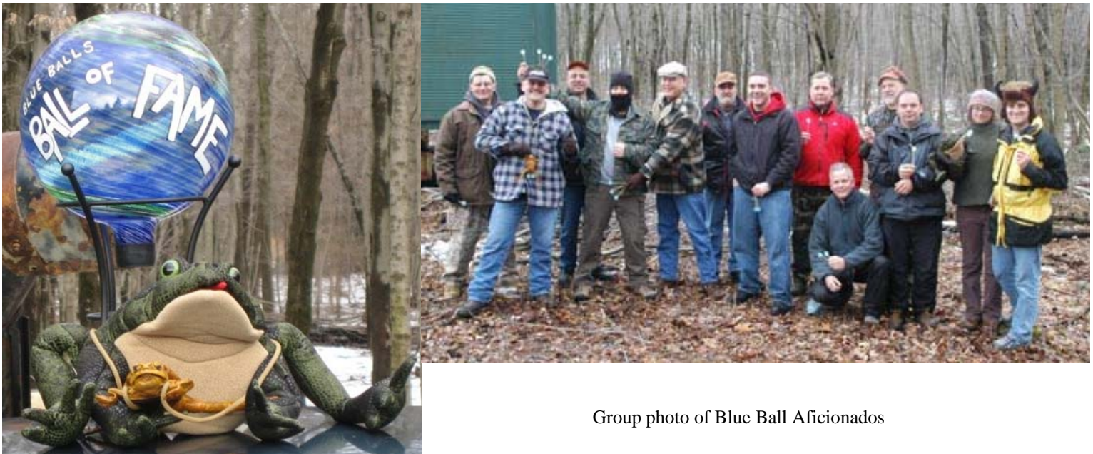
Group photo of Blue Ball Aficionados

Here are some pics - complete details to follow on the WLOPA web site in a few days. http://www.wlopa.com/wlopaair.htm