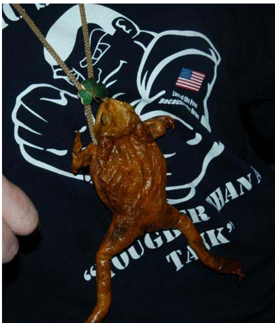
Luck 'o' the Irish Sac