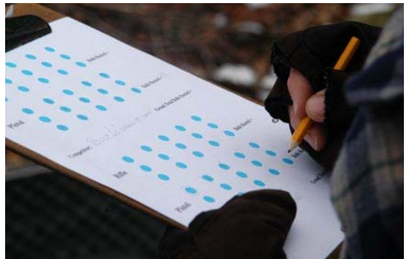
Official Blue Ball Score Sheet