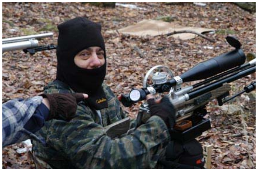
Lone surviving LA Bank Robber