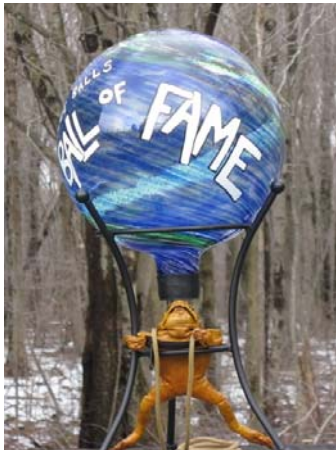
TEAM FROG SAC WINS AGAIN!

Well winter is almost over and we'll all soon be into another fun year of field target shooting without our parkas. We're off to a good start with a very active January and February. More clubs than ever and more shoots to attend. FT is alive and well in the USA.