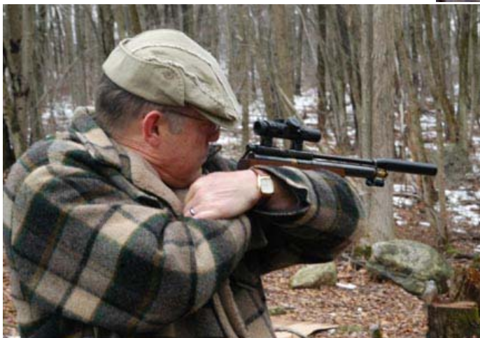
They call him the BREEZE