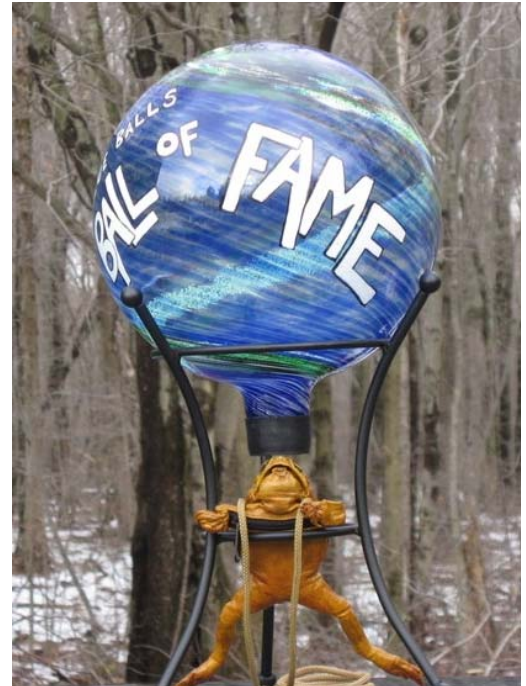
Frog SAC Mojo