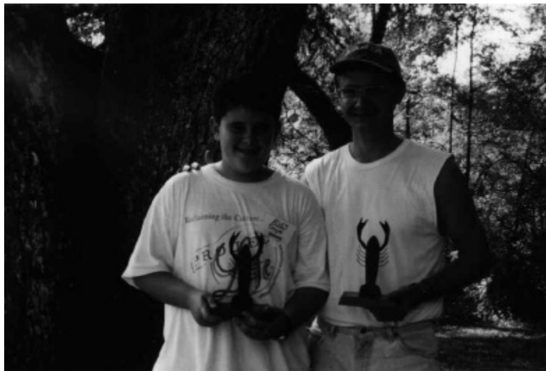
Like Father, like son.