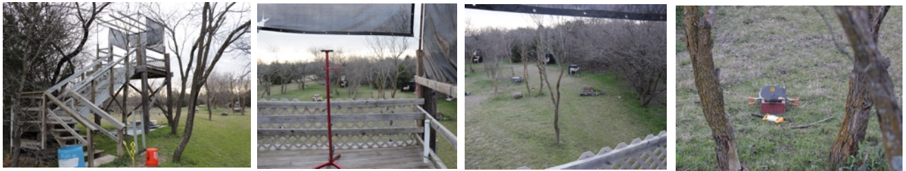
1 Elevated Tower Shots